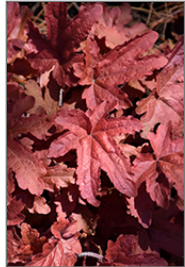
Fun and Games Red Rover Foamy Bells foliage

This is a relatively low maintenance plant, and should be cut back in late fall in preparation for winter. It is a good choice for attracting hummingbirds to your yard. It has no significant negative characteristics.