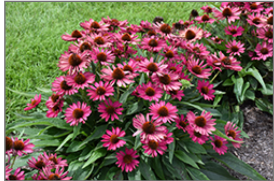
Kismet Raspberry Coneflower in bloom

Kismet Raspberry Coneflower will grow to be about 16 inches tall at maturity, with a spread of 24 inches. Its foliage tends to remain dense right to the ground, not requiring facer plants in front. It grows at a fast rate, and under ideal conditions can be expected to live for approximately 10 years. As an herbaceous perennial, this plant will usually die back to the crown each winter, and will regrow from the base each spring. Be careful not to disturb the crown in late winter when it may not be readily seen!