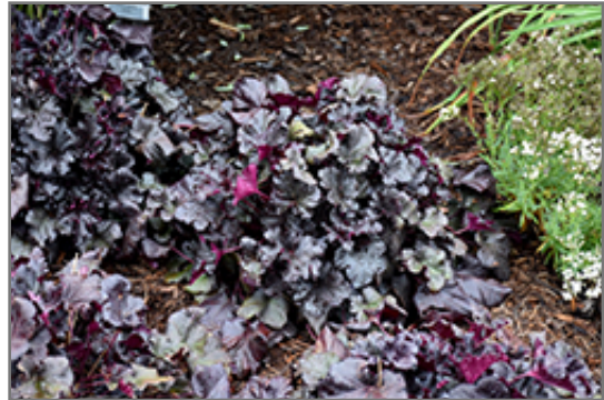
Black Pearl Coral Bells

Black Pearl Coral Bells is a fine choice for the garden, but it is also a good selection for planting in outdoor pots and containers. With its upright habit of growth, it is best suited for use as a 'thriller' in the 'spiller-thriller-filler' container combination; plant it near the center of the pot, surrounded by smaller plants and those that spill over the edges. Note that when growing plants in outdoor containers and baskets, they may require more frequent waterings than they would in the yard or garden.