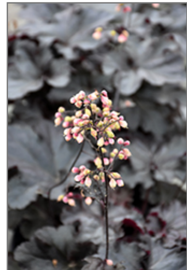
Black Pearl Coral Bells flowers