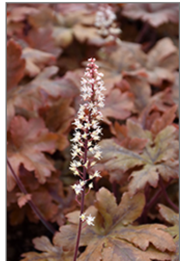
Hopscotch Foamy Bells flowers