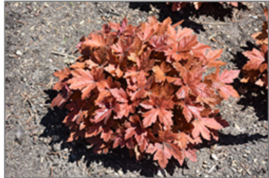
Hopscotch Foamy Bells