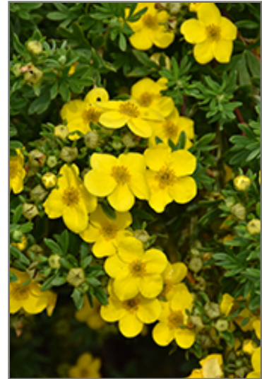
Happy Face Yellow Potentilla flowers

Happy Face Yellow Potentilla is recommended for the following landscape applications;