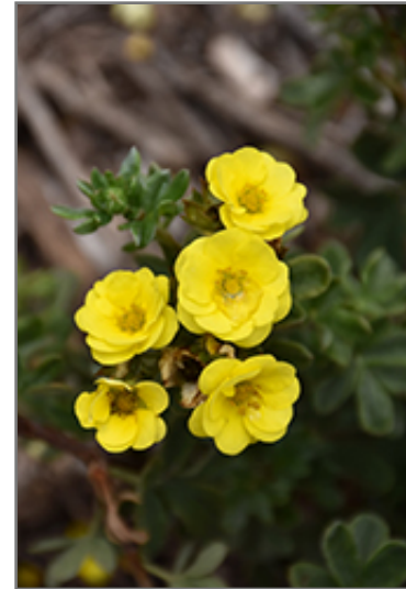
Citrus Tart Potentilla flowers

Citrus Tart Potentilla is recommended for the following landscape applications;