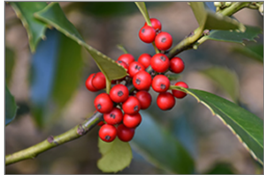
Yule Bright Holly fruit

Yule Bright Holly is recommended for the following landscape applications;