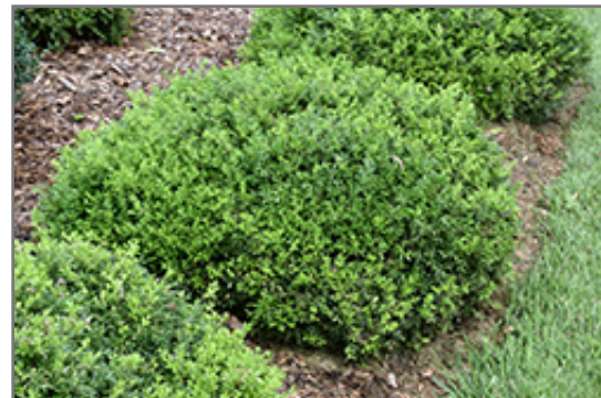
Tide Hill Boxwood