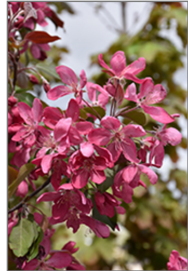
Royal Mist Flowering Crab flowers

Royal Mist Flowering Crab is recommended for the following landscape applications;