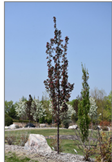
Royal Mist Flowering Crab in bloom