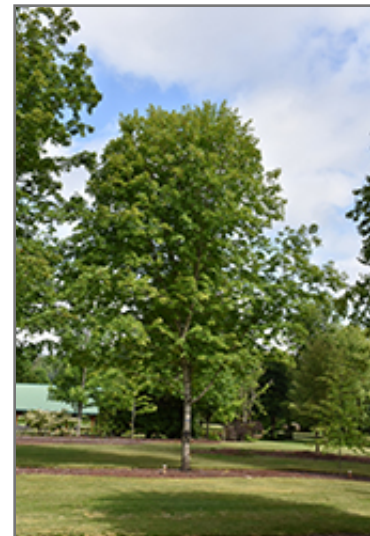
John Pair Sugar Maple