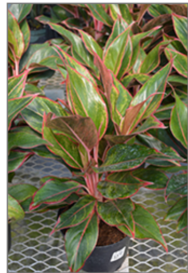
Siam Aurora Chinese Evergreen in full