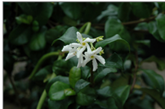
Madison Star-Jasmine flowers