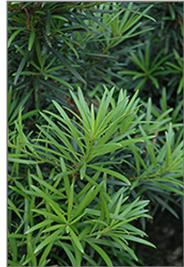
Japanese Yew foliage

When grown indoors, Japanese Yew can be expected to grow to be about 6 feet tall at maturity, with a spread of 3 feet. It grows at a slow rate, and under ideal conditions can be expected to live for approximately 50 years. This houseplant will do well in a location that gets either direct or indirect sunlight, although it will usually require a more brightly-lit environment than what artificial indoor lighting alone can provide. It does best in average to evenly moist soil, but will not tolerate standing water. The surface of the soil shouldn't be allowed to dry out completely, and so you should expect to water this plant once and possibly even twice each week. Be aware that your particular watering schedule may vary depending on its location in the room, the pot size, plant size and other conditions; if in doubt, ask one of our experts in the store for advice. It is not particular as to soil type or pH; an average potting soil should work just fine.