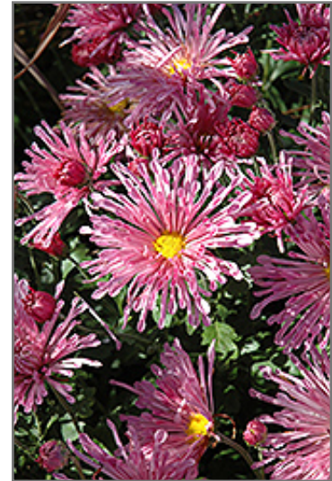
Centerpiece Chrysanthemum flowers