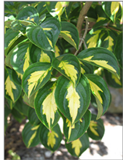
Gold Cup Chinese Dogwood foliage