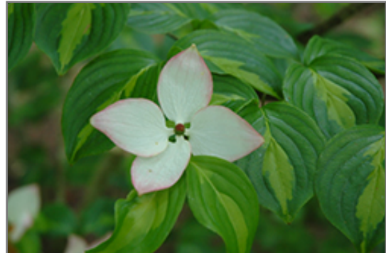
Gold Cup Chinese Dogwood flowers

Gold Cup Chinese Dogwood is recommended for the following landscape applications;