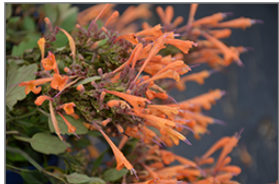
Kudos Mandarin Hyssop flowers