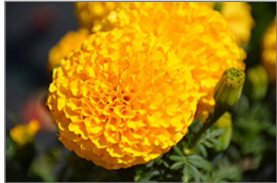
Taishan Gold Marigold flowers

Taishan Gold Marigold is recommended for the following landscape applications;