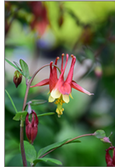
Wild Red Columbine flowers