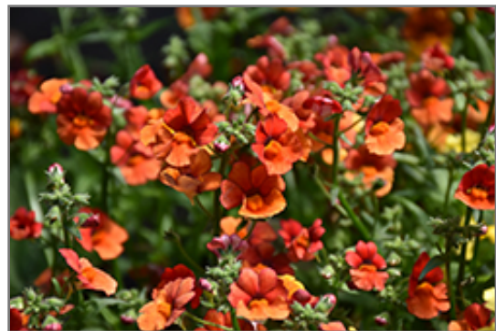
Sunsatia Blood Orange Nemesia flowers