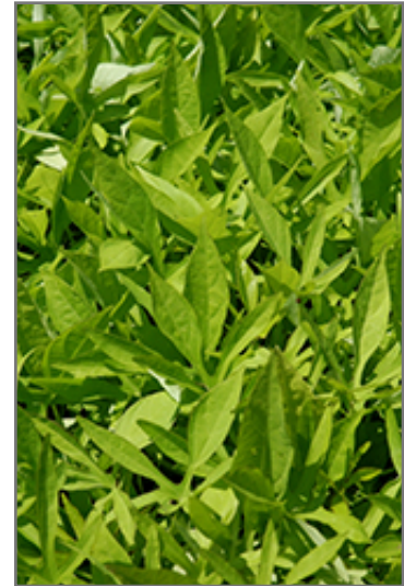
SolarPower Lime Sweet Potato Vine foliage