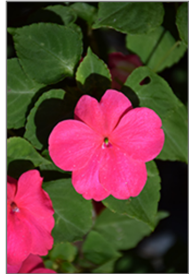
Lollipop Fruit Punch Rose Impatiens flowers