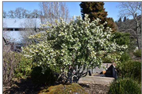
Burkwood Osmanthus in bloom