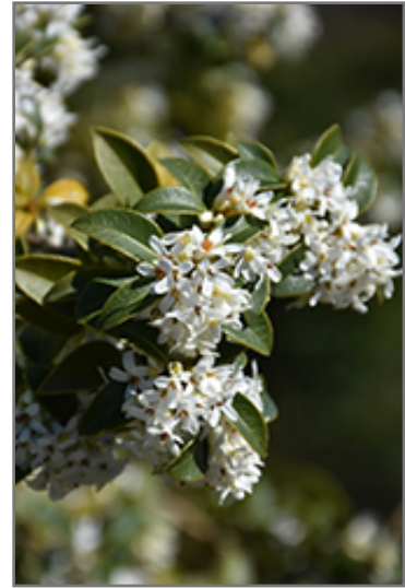
Burkwood Osmanthus flowers

Burkwood Osmanthus is a dense multi-stemmed evergreen shrub with an upright spreading habit of growth. Its average texture blends into the landscape, but can be balanced by one or two finer or coarser trees or shrubs for an effective composition.