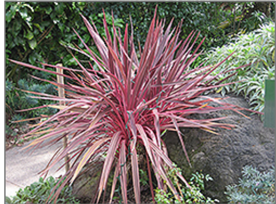
Electric Pink Cordyline

Electric Pink Cordyline is recommended for the following landscape applications;