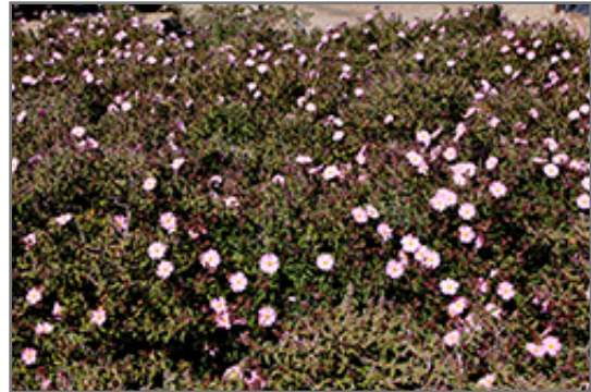
Pink Rockrose in bloom