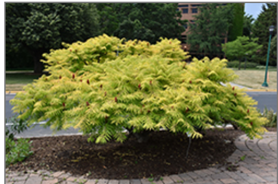
Tiger Eyes Sumac