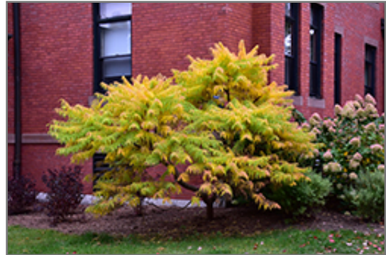
Tiger Eyes Sumac in fall