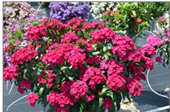
Jolt Cherry Hybrid Pinks in bloom