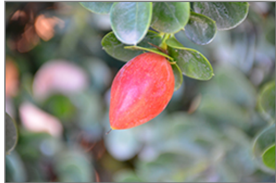
Natal Plum fruit

Natal Plum is a good choice for the edible garden, but it is also well-suited for use in outdoor pots and containers. Its large size and upright habit of growth lend it for use as a solitary accent, or in a composition surrounded by smaller plants around the base and those that spill over the edges. It is even sizeable enough that it can be grown alone in a suitable container. Note that when grown in a container, it may not perform exactly as indicated on the tag - this is to be expected. Also note that when growing plants in outdoor containers and baskets, they may require more frequent waterings than they would in the yard or garden.