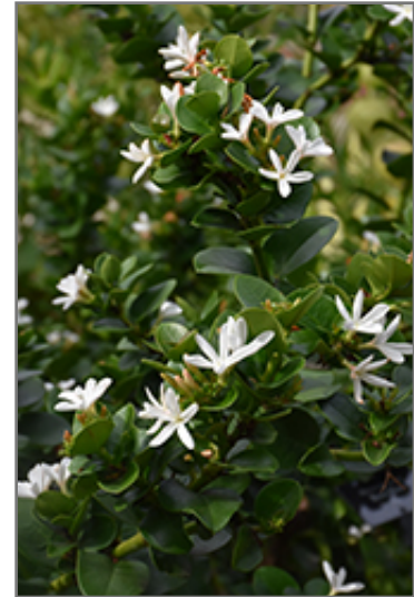
Natal Plum flowers

Natal Plum has attractive dark green evergreen foliage which emerges coppery-bronze in spring on a plant with an upright spreading habit of growth. The glossy round leaves are highly ornamental and remain dark green throughout the winter. It features dainty lightly-scented white star-shaped flowers along the branches from early spring to mid summer. It features an abundance of magnificent red berries from late spring to late fall.