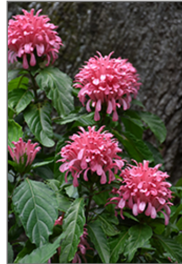
Brazilian Plume Flower flowers