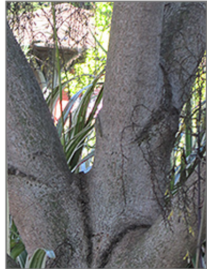
Chinese Cinnamon bark

This tree does best in full sun to partial shade. It prefers to grow in average to moist conditions, and shouldn't be allowed to dry out. It is particular about its soil conditions, with a strong preference for sandy, alkaline soils, and is able to handle environmental salt. It is highly tolerant of urban pollution and will even thrive in inner city environments. This species is not originally from North America.