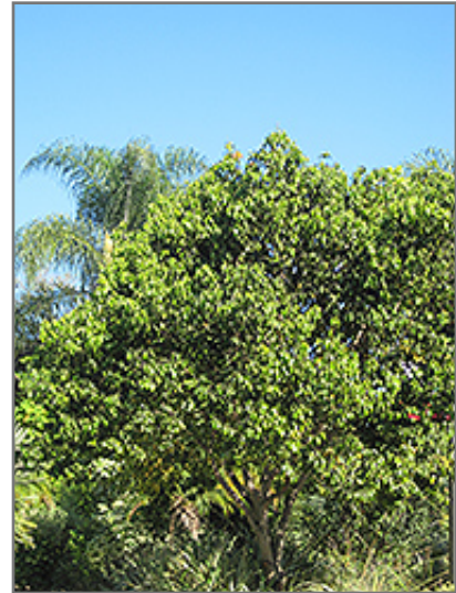
Chinese Cinnamon

Chinese Cinnamon is an evergreen tree with an upright spreading habit of growth. Its average texture blends into the landscape, but can be balanced by one or two finer or coarser trees or shrubs for an effective composition.