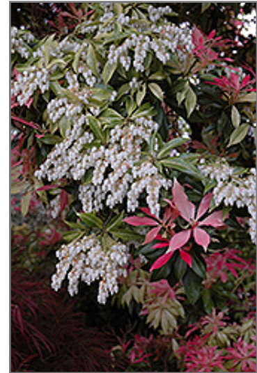
Valley Fire Japanese Pieris flowers

Valley Fire Japanese Pieris is recommended for the following landscape applications;