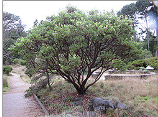
Big Berry Manzanita in bloom

Big Berry Manzanita makes a fine choice for the outdoor landscape, but it is also well-suited for use in outdoor pots and containers. Its large size and upright habit of growth lend it for use as a solitary accent, or in a composition surrounded by smaller plants around the base and those that spill over the edges. It is even sizeable enough that it can be grown alone in a suitable container. Note that when grown in a container, it may not perform exactly as indicated on the tag - this is to be expected. Also note that when growing plants in outdoor containers and baskets, they may require more frequent waterings than they would in the yard or garden.