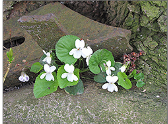
White Wood Violet in bloom

White Wood Violet is recommended for the following landscape applications;