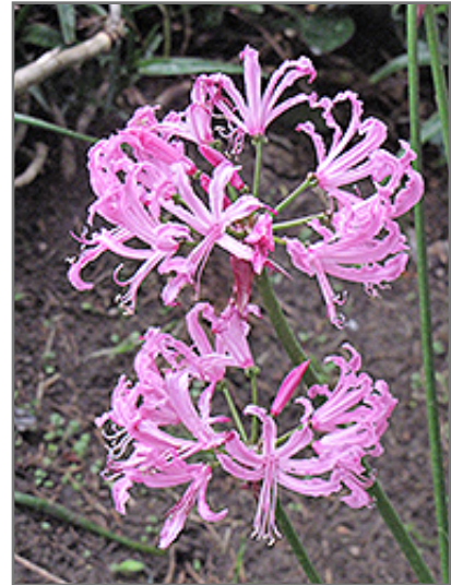
Bowden Cornish Lily flowers

Bowden Cornish Lily is recommended for the following landscape applications;