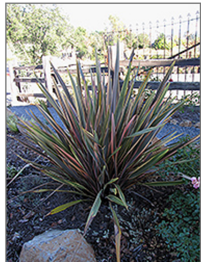
Rainbow Sunrise New Zealand Flax