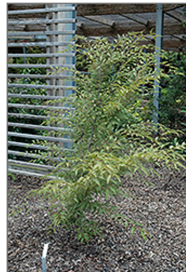
Silver Lace Japanese Hornbeam