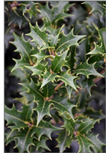
Gulftide False Holly foliage