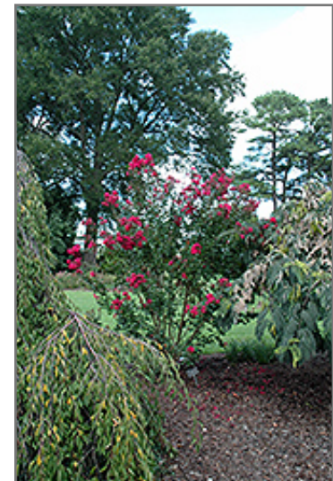
Pink Velour Crapemyrtle in bloom