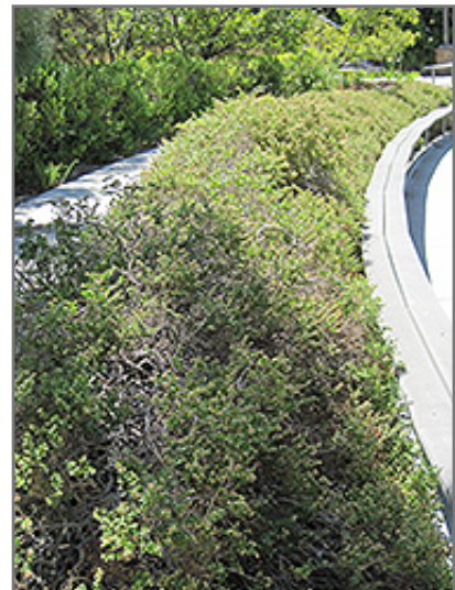
Pigeon Point Coyote Brush