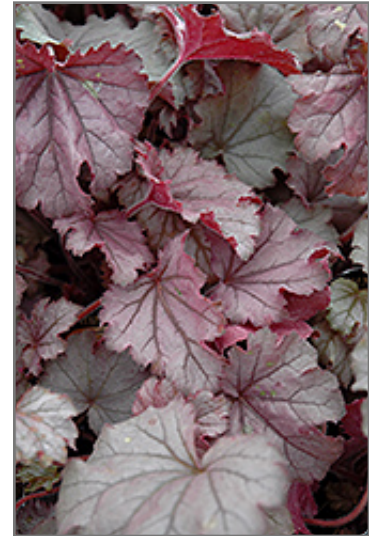
Little Cuties Sugar Berry Coral Bells foliage

Little Cuties Sugar Berry Coral Bells is recommended for the following landscape applications;