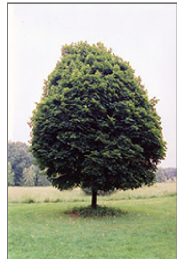
Cleveland Norway Maple