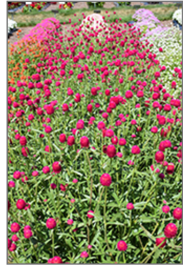
Qis Carmine Gomphrena in bloom

Qis Carmine Gomphrena is a fine choice for the garden, but it is also a good selection for planting in outdoor pots and containers. With its upright habit of growth, it is best suited for use as a 'thriller' in the 'spiller-thriller-filler' container combination; plant it near the center of the pot, surrounded by smaller plants and those that spill over the edges. Note that when growing plants in outdoor containers and baskets, they may require more frequent waterings than they would in the yard or garden.