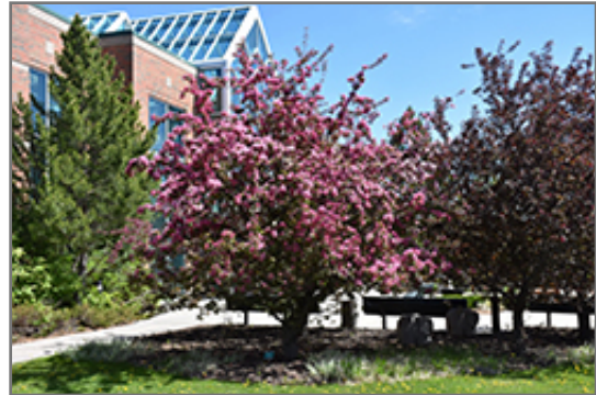
Makamik Flowering Crab in bloom

Makamik Flowering Crab is recommended for the following landscape applications;