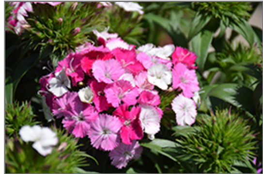
Amazon Rose Magic Pinks flowers

Amazon Rose Magic Pinks is recommended for the following landscape applications;