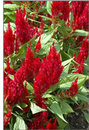
First Flame Red Celosia flowers

First Flame Red Celosia is recommended for the following landscape applications;