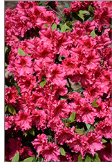
Red Ruffles Azalea flowers