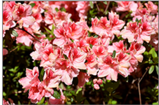
Gloria Azalea flowers