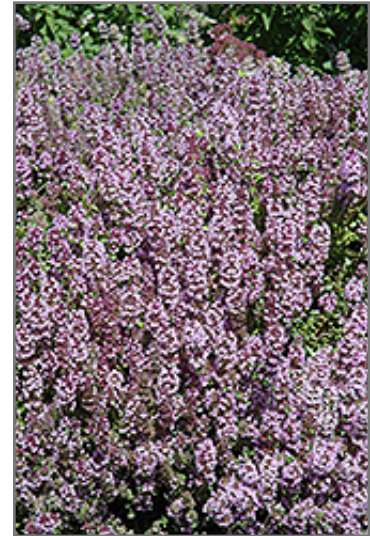
Mother-of-Thyme in bloom

This plant will require occasional maintenance and upkeep, and is best cleaned up in early spring before it resumes active growth for the season. Deer don't particularly care for this plant and will usually leave it alone in favor of tastier treats. Gardeners should be aware of the following characteristic(s) that may warrant special consideration;