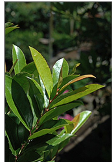
Compact Cherry Laurel foliage