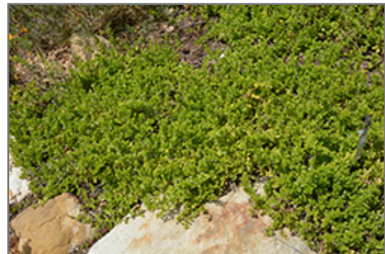
Yerba Buena