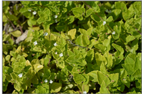
Yerba Buena foliage

This plant does best in partial shade to shade. It prefers to grow in average to moist conditions, and shouldn't be allowed to dry out. It is not particular as to soil type or pH. It is somewhat tolerant of urban pollution. This species is native to parts of North America.