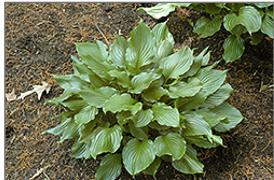
Lakeside Coal Miner Hosta