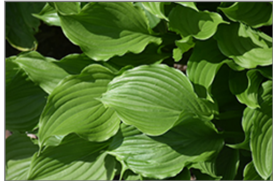
Lakeside Coal Miner Hosta foliage

Lakeside Coal Miner Hosta is recommended for the following landscape applications;